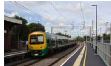
Decks & Platforms