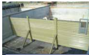
Baffle wall, barriers & bunds